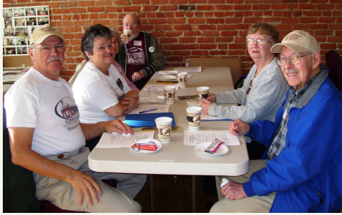
Top photo-Chesterfield Twp. Historical Society at the Heritage Alliance held April 4 in Romeo. Below-members in the Senior Center where the society holds its regular meetings at 7 p.m. on the first Tuesday of the month.