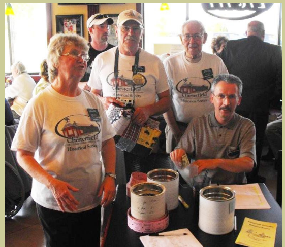
The annual Pasta Dinner of the Chesterfield Twp. Historical Society was held on Tuesday, May 12. For the first time it was at Rosie O'Grady's on 23 Mile Road, which just underwent a remodeling. Over 100 people attended and took advantage of the great food, door prizes and homemade desserts!