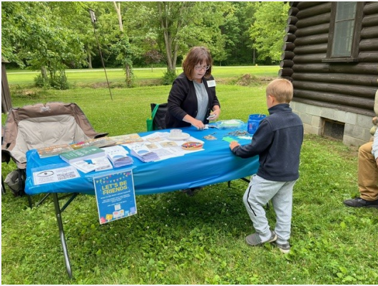
Friends of the Chesterfield Township Library provided crafts during Log Cabin Days