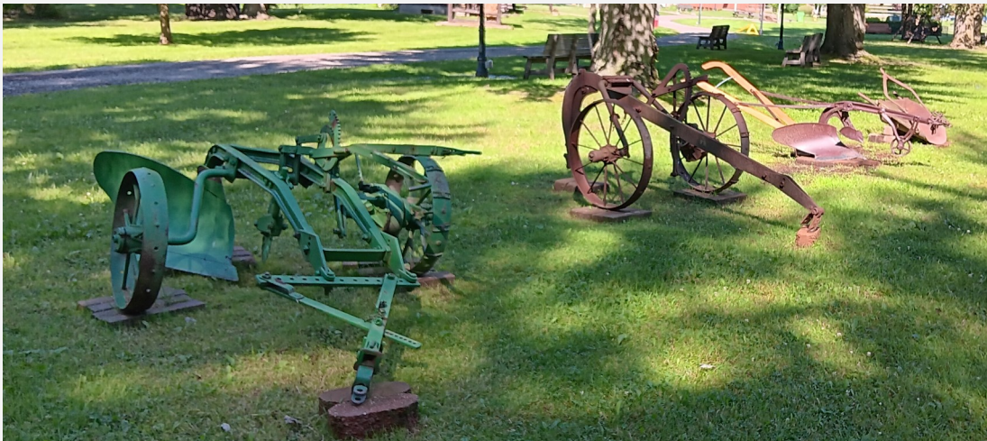
Plows donated by Rosseel's Farm Equipment