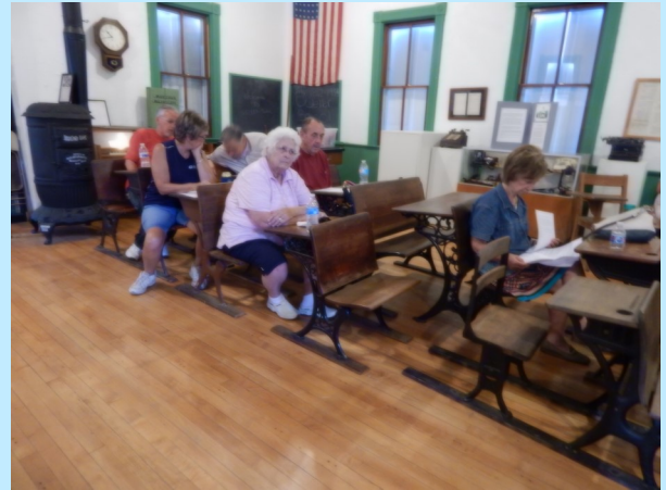
The August meeting was held in the Weller Schoolhouse