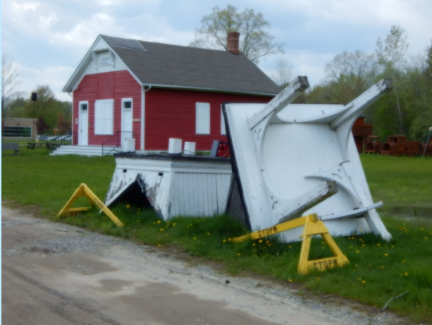
The Weller Schoolhouse will be without its bell and bell tower while repairs are being executed. A completion date in 2020 is predicted.