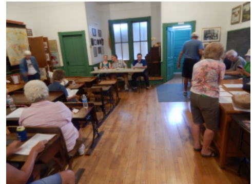
Historical Society Members examine schoolhouse exhibits prior to summer meeting.