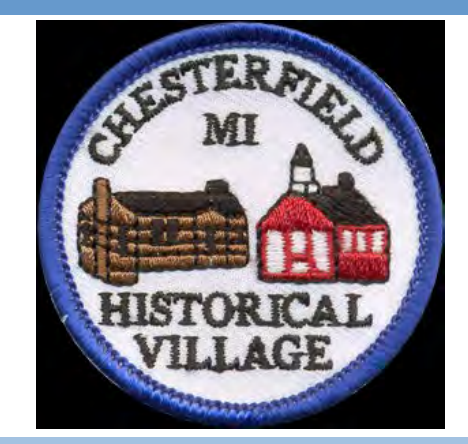
We have a patch to commemorate your visit to the Historical Village-only $2.00!