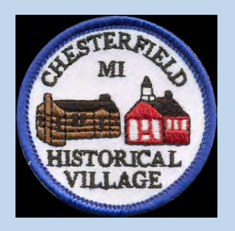
New Patch! See back page.